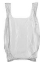
A plastic bag